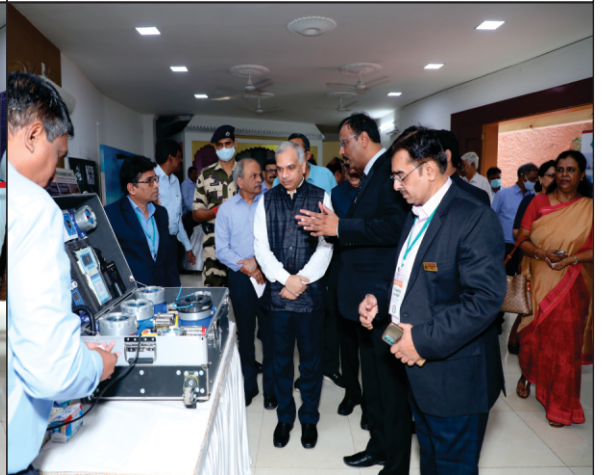
Chief Guest visiting the stalls at Exhibition