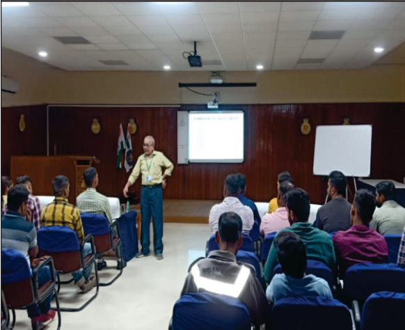
Training program at Naval Dockyard, Mumbai