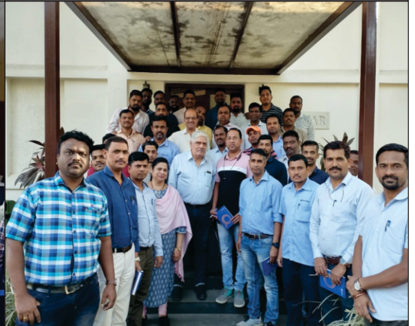
Training program at Bharat Bijlee Ltd.