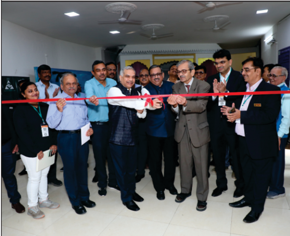
Inauguration of the Exhibition on Safety Appliances