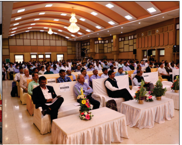
Delegates attending the 25 th Regulating Agencies & Safety Professionals Meet