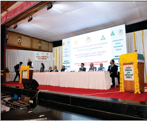
25 th Regulating Agencies & Safety Professionals Meet