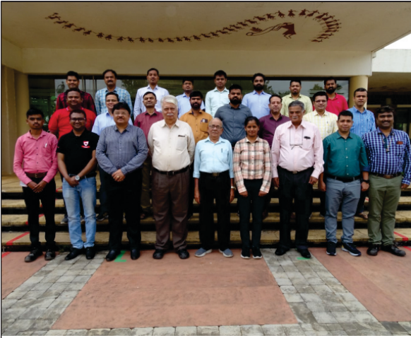
Training program at Mahindra & Mahindra, Ltd, Nashik