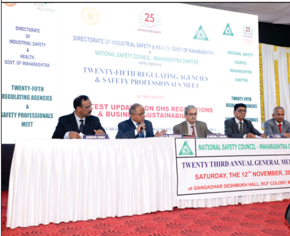
23 rd Annual General Meeting