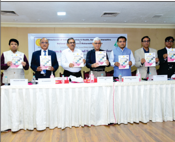
Launching Ceremony of the "Guidelines & SOPs on Road Safety for Industries"