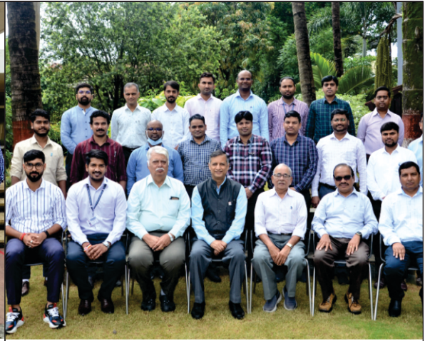
Training program at HPCL, Nigdi, Pune