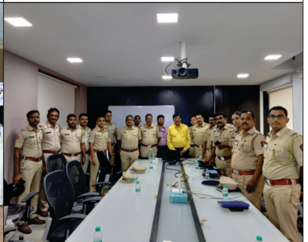
Training on "Transportation of Hazardous Chemicals" for officers, Highway Traffic police