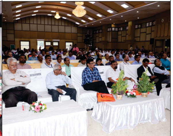
Members attending the 23 rd AGM