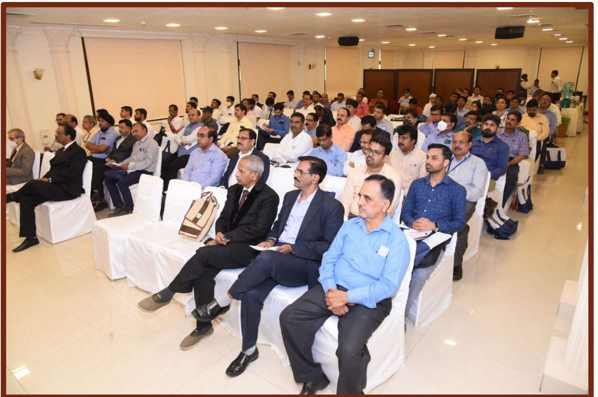
Delegates attending the 24th Safety Professionals Meet