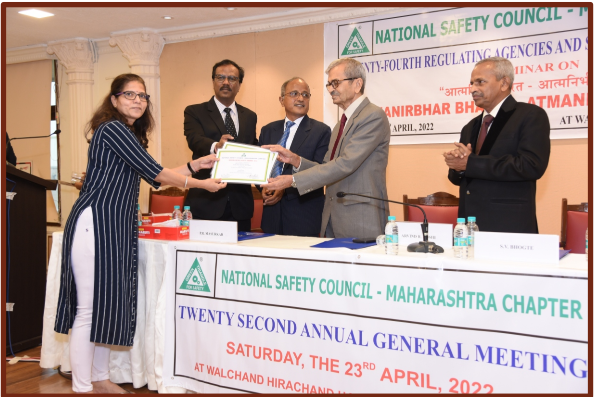
Maharashtra Safety Awards Competition – 2020