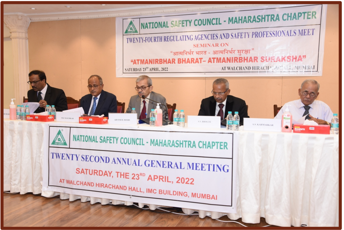
22nd Annual General Meeting