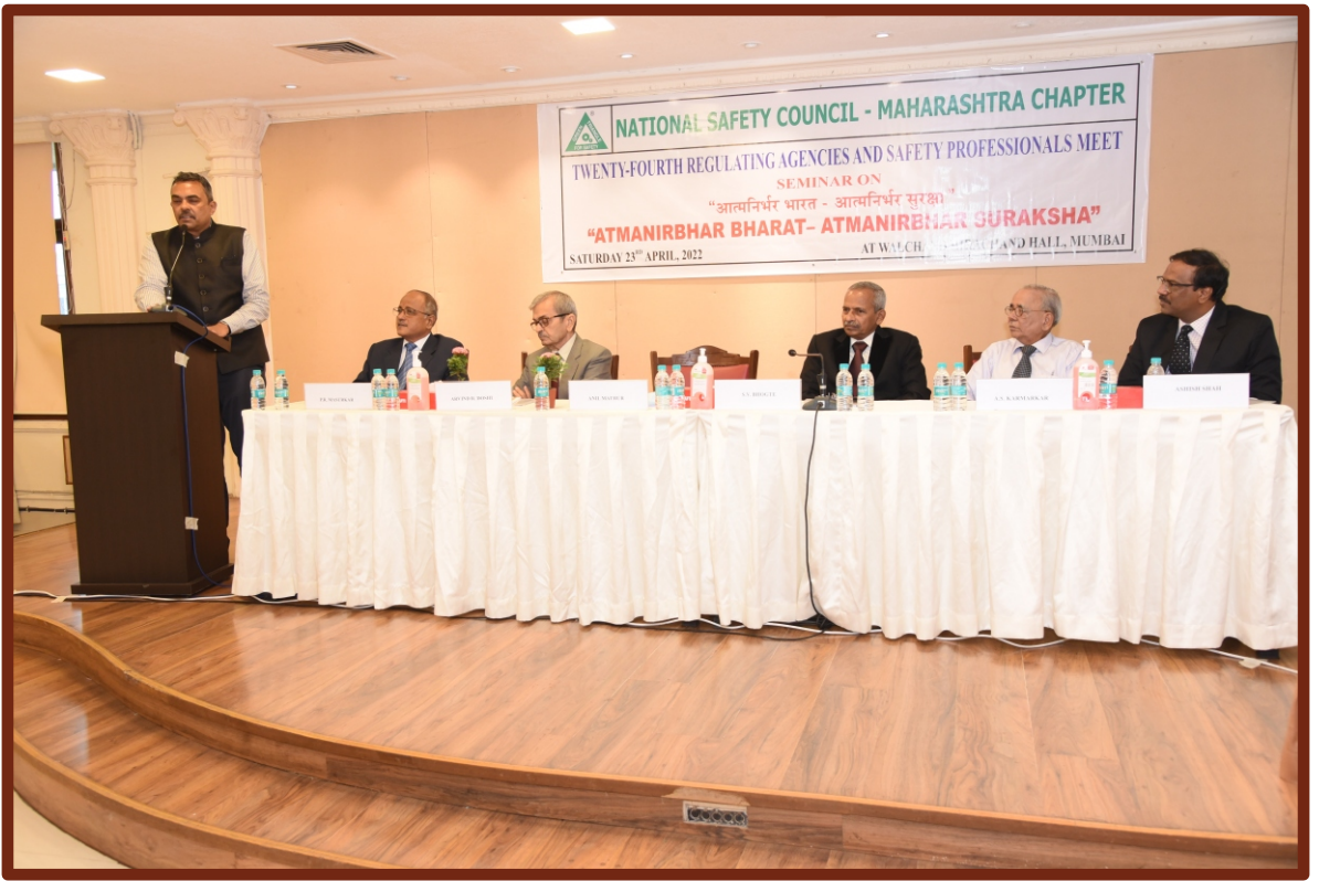
24th Regulating Agencies & Safety Professionals Meet